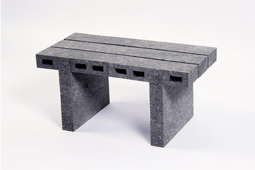
black coffee table