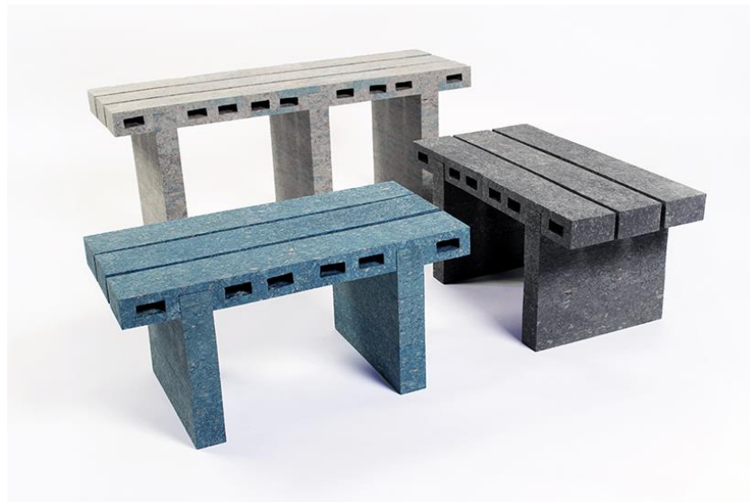
paperbricks pallet series: coffee tables and bench

following his initial idea, the artist created the paperbricks pallet series to show how the bricks could be constructively transformed into furniture. his collection currently consists of a bench and two coffee tables.