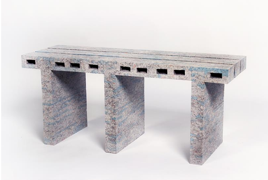
the final outcome creates a marble-like color