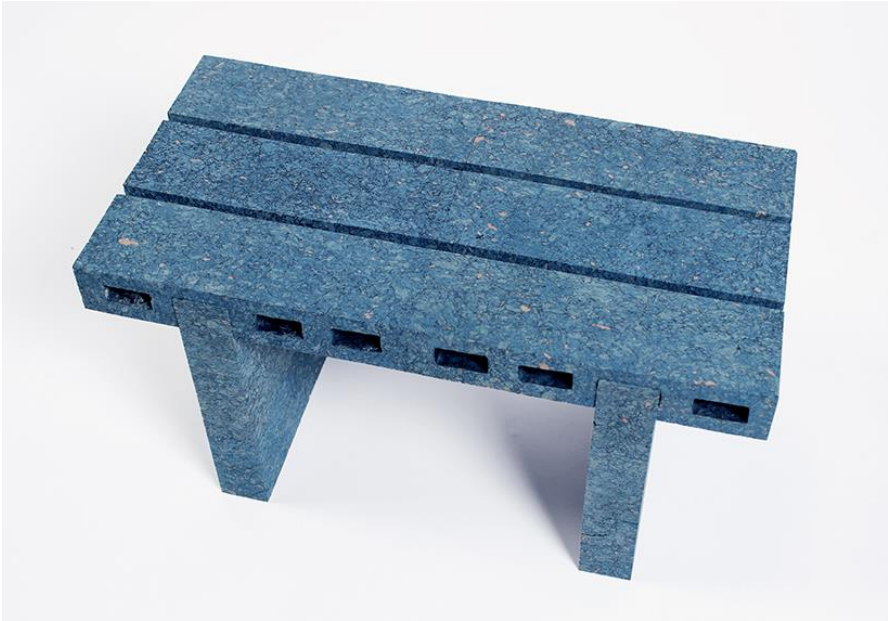
blue coffee table