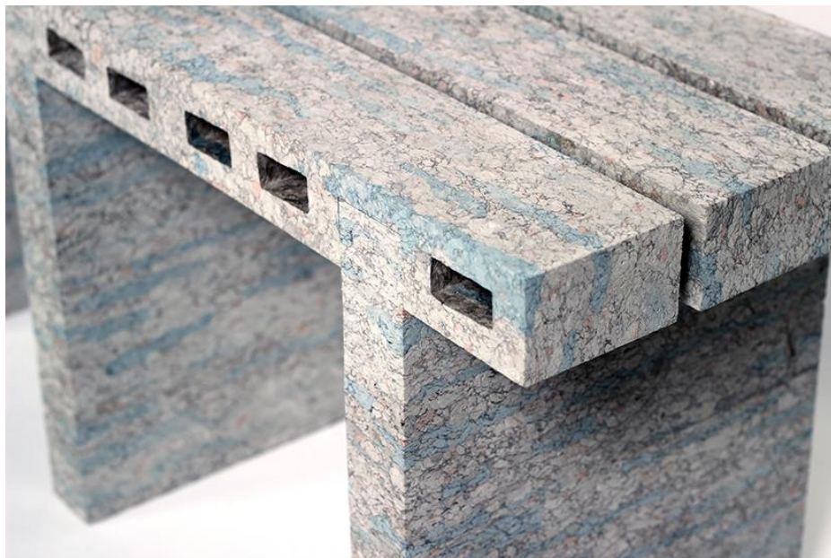
detail of the bench