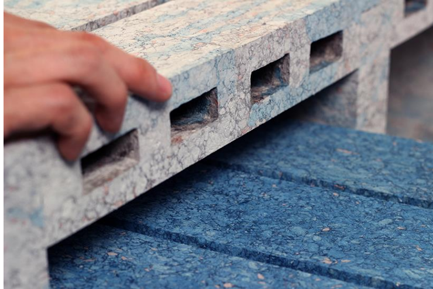
close-up revealing the texture and shape

woojai lee 's project consists of crafting objects using recycled newspapers, which are first turned into pulps and mixed with glue. the product is then shaped into bricks. the result is a marble-like surface with the same delicate texture of paper. however, the final structure is as solid as an actual brick.