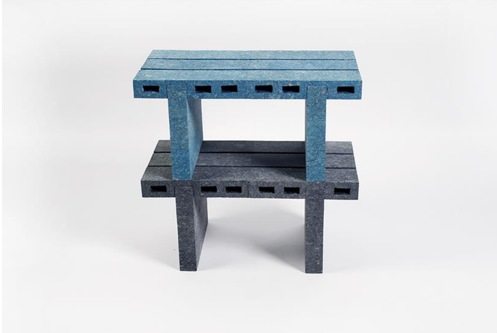
the coffee tables are as stable as regular furniture