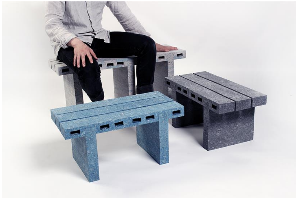
demonstrating how sturdy the bench is