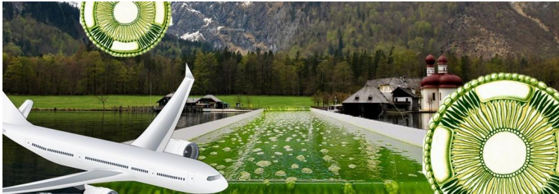
Biofuels in Bavaria: Airbus and TU Munchen are using their Algae Greenhouses to investigate Aviation biofuel sources.

There is also the re-purposing of tobacco plants using Deinococcus, which is being used by the French giant Deinove to make biofuels from organic waste materials with the US Tyton.