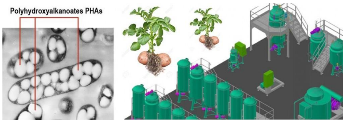
Polyhydroxyalkanoates (PHAs) are linear polyesters produced naturally by bacterial fermentation of sugars.

Natural elimination of a biopolymers in water in just a few days is a rarely achieved and is an exceedingly tough challenge for Bioplastic researchers. Other bio-plastics manufacturers looking change the GreenTech Polymer industry include Carbios from France, who recently opened a new factory in the Auvergne region, and Avantium from the Netherlands