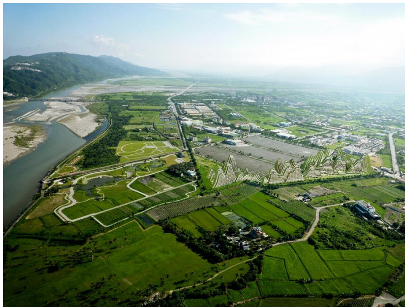
This visualisation shows the site of Hualien Residences, which is five kilometres south of Hualien City, between the ocean and mountains

The collection includes lounge seating and sunbeds, a wooden dining table, a lamp, a chest of drawers, a coffee table and shelving.