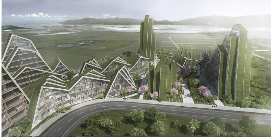
This visualisation shows the offset outlines of the buildings at Hualien Residences, which will create a stylised version of the spine of mountains to the west

The collection includes lounge seating and sunbeds, a wooden dining table, a lamp, a chest of drawers, a coffee table and shelving.