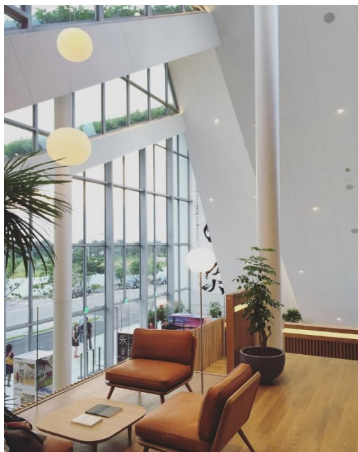
This photograph shows seating and a coffee table inside the model holiday home at Hualien Residences

"The angled silhouettes add an almost traditional vernacular feeling of attics and porches in the middle of the dense modern development," said BIG.