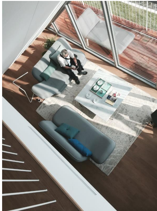
KiBiSi's collection of furniture on show in the Hualien Residences model home has been designed to compliment the architecture of the houses

Outdoor paths will snake around the site, while underground "jogging pathways" will be added to encourage residents to exercise. The complex will also house an on-site medical centre.