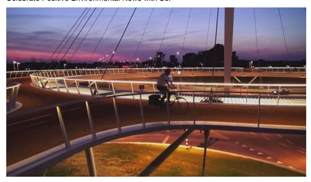
ipv Delft/Screen capture