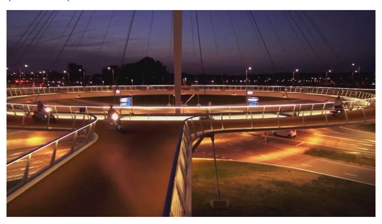
ipv Delft/Screen capture